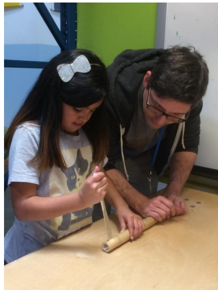
Parent Volunteers helping students split bamboo to create Tongva inspired clappers.